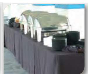
Simple Food Display