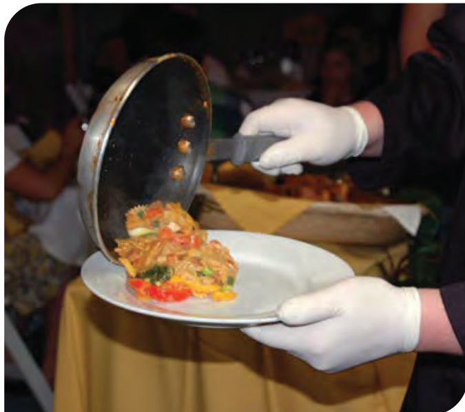
BANQUETS, WEDDINGS, AND RECEPTIONS