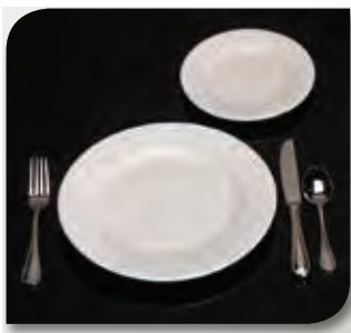
China Place Setting