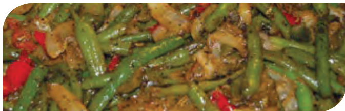
8 — Cajun and Creole; French; BBQ; Comfort Food