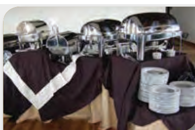
Elegant Food Display